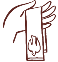
Holy Orders (Ordination)