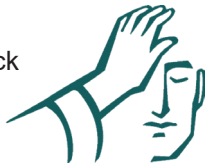
Anointing of the Sick (Last Rites)